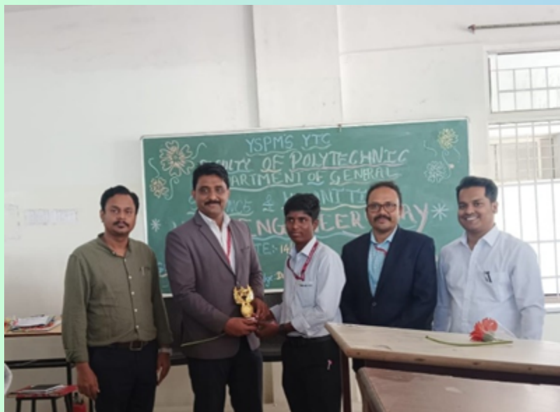
Prize Distribution to the winner